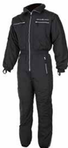
Layer 2: Under suit